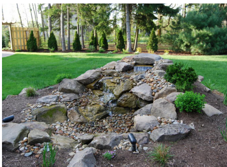
A pondless waterfall provides tranquility and is cost effective.

Now what do you hear? If it's the drone of traffic or neighbors who sound like they are right in your yard, your landscape is lacking